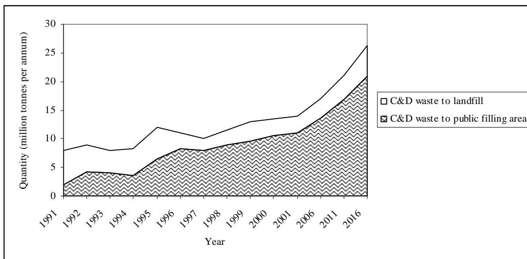
Figure 1: Trend of quantities of construction and demolition waste disposed of at public filling areas and landfills from 1991-2016 (Environmental Protection Department, 2006)