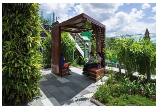
Figure 1: Secret garden, sheltered seating area (Source: Christopher Frederick Jones) Figure 2: Secret garden, grassed lawn area and view (Source: Christopher Frederick Jones)

Bench Diaries were left in four of the gardens: Secret garden (SG, see Figure 3), Adventure garden (AG, Figures 4 and 5), Staff garden (StG, Figure 6) and Babies garden (BG, Figure 7).