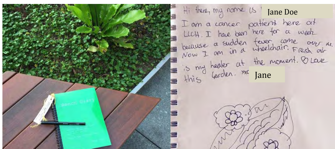
Figure 2: Bench diary in situ and example image from bench diary (deidentified)

(Approval no. 1500000599) and Children's Health Queensland (HREC No: HREC/15/QRCH/182) for the current study. The cover of our Bench Diaries contained the inscription: "Tell me, why are you here? How are you feeling? What do you enjoy? Tell me what is on your mind...?" (see Figure 2).