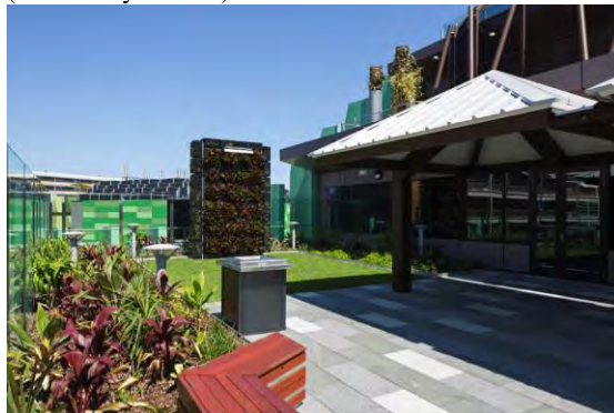
Figure 6: Staff garden, showing covered area which now features tables and chairs, and the garden areas with a green wall