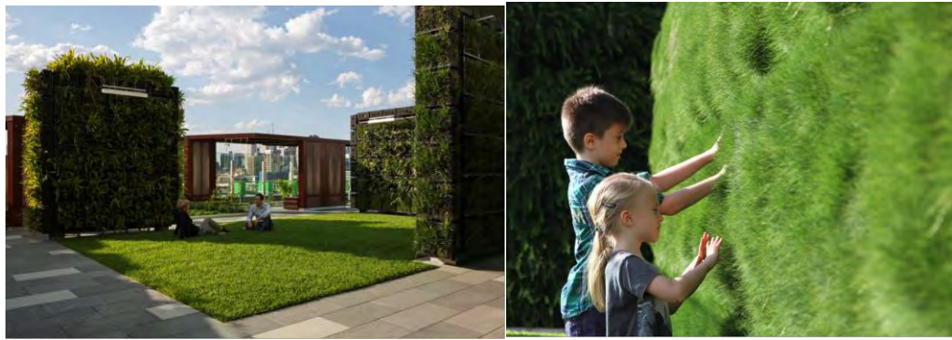
Figure 4: a) Adventure garden, a section of the grassed green wall and therapy area; b) Grassed green wall in Adventure garden covering the building façade, which attracts people to touch it