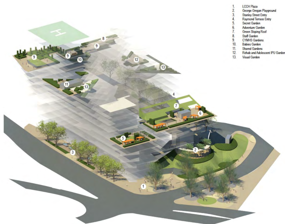
Figure 2: Schematic of the 11 healing gardens and 2 community spaces (#1, #13)

This paper reports on the use and benefits of the gardens in the months following the opening of the hospital, to contribute to emergent appreciation of these spaces and the value they provide. We begin with a discussion of the research and theory relating to human responses to nature and gardens is reviewed to provide background to the potential benefits that such gardens may provide in healthcare settings. We include a summary of findings from similar key studies reviewing the use and benefits of hospital gardens elsewhere. We then present the findings from analysing unsolicited comments left in visitors' books in four of the gardens, reflecting on insights gained from the end-user experiences of these spaces. We anticipate that our findings will be immediately useful to landscape architects, designers and healthcare professionals around the world who are considering best practice opportunities to promote well-being in patient care.