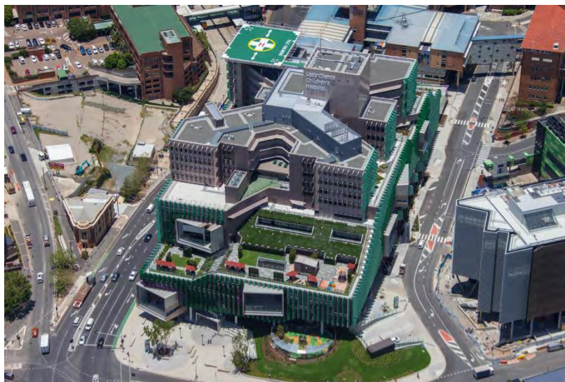
Figure 1: Aerial view of hospital, showing the Secret Garden (left), Adventure Garden (right) and QCH Plaza beneath

The Lady Cilento Children's Hospital (LCCH) was opened in November 2014 in inner-city Brisbane, Australia with 11 healing gardens integrated into the hospital layout (Figure 1, Figure 2). The gardens were designed to appeal to all senses, and respond to needs of patients, their families and hospital staff by reducing stress and anxiety and afford a place for retreat and contemplation (Conrad Gargett, 2015). Seven years of extensive research and collaboration went into the design and development of the gardens as part of a broader, integrated approach to the hospital design.