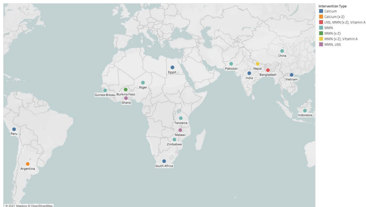
Abbreviations: LNS= lipid-nutrient supplementation; MMN= multiple micronutrient supplementation; x2= two separate trials of the specified intervention type were conducted in this location