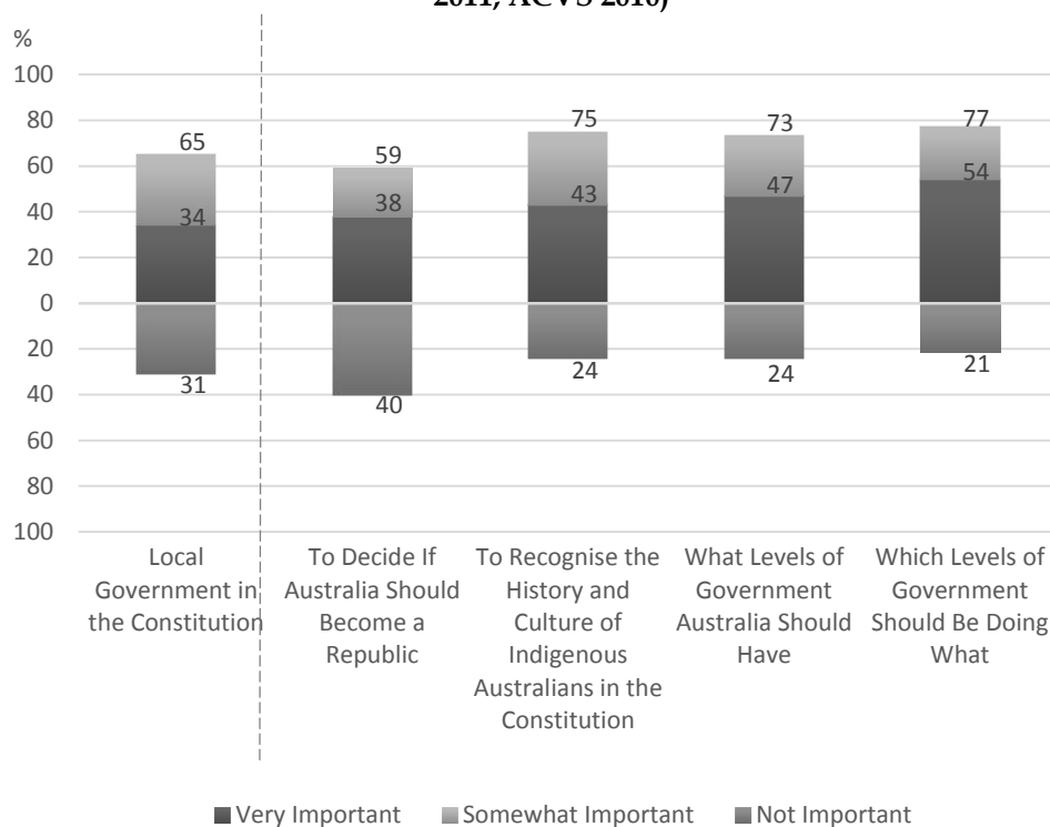
Figure 3: Importance of holding a referendum on various issues (Newspoll 2011; ACVS 2010) 78