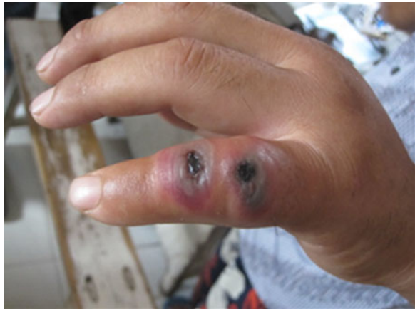
Fig. 2. Typical skin lesions (vesicles with central black eschar) on the little finger of the index case that developed several days after he slaughtered and butchered a sick cow on 25 July 2012.

The index case was notified to public health officers on 2 August 2012 by an alert physician in a tertiary infectious disease specialist hospital, who raised the diagnostic possibility of cutaneous anthrax when examination revealed typical skin lesions on the patient's little finger, i.e. vesicles with a central black eschar (Fig. 2). Before this, the index case had visited different types of hospital (local village, township, county) between 29 July and 1 August, and was