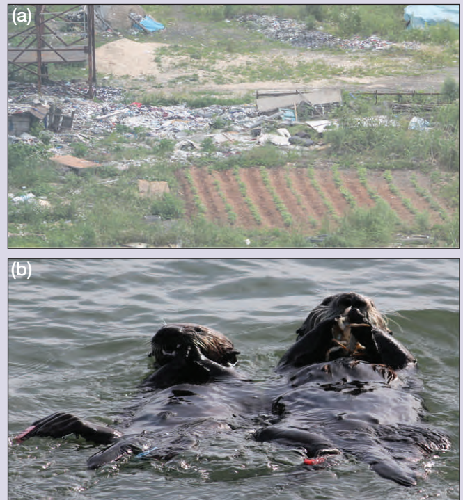
Figure 3. (a) Vegetables grown next to heaps of waste in a city in Liaoning province, China. Improved sanitation can reduce risk of intestinal infection due to contaminated food and water. (b) Sea otters ( Enhydra lutris ) forage near the shoreline in Monterey Bay, CA. Otters closer to human-occupied coastlines have higher infection prevalence of Toxoplasma gondii and Sarcocystis neurona .

Once human pathogens have reached the Established stage, efforts to reduce spatial spread are abandoned and focus shifts to reducing the transmission and severity of disease. One way of reducing transmission of food- and water-borne pathogens such as cholera, Escherichia coli , leptospirosis, and typhoid is through improved sanitation (Ashbolt 2004). For wildlife, improved sanitation of terrestrial environments may reduce transmission of terrestrial pathogens to marine ecosystems (Figure 3). Sea otters foraging near human-dominated coastlines are at higher risk of infection with two pathogens – Toxoplasma gondii and Sarcocystis neurona , both shed by human commensal species (cats and opossums, respectively) – than those foraging on higher quality prey items that may be present in higher abundance in areas farther from human development (Johnson et al. 2009). Managing human and wildlife disease requires an adaptive approach that addresses the unique attributes of each group of hosts and pathogens.