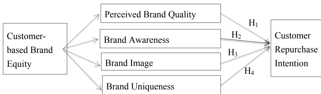
Figure 2 The Framework of This Study

H 4 : Brand uniqueness positively impacts customer's repurchase intention.