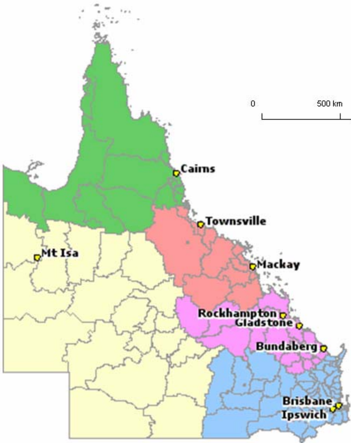
Figure 2 Map of Queensland.