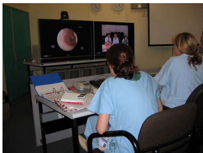
Figure 1 Tele-ENT clinic in progress. The specialist is able to view video-otoscopic images during a videoconference appointment.

Telemedicine has been used for the pre-screening of potential ENT surgical patients as part of a research project facilitated by the University of Queensland's Centre for Online Health (COH) [9]. Since 2003, patients in selected regional areas have been referred by their local primary healthcare providers to a telemedicine clinic at their local hospital. Instead of travelling to Brisbane to see the specialist, an ENT consultation is conducted via videoconferencing. During the videoconference appointment, an ENT examination is carried out using a video-otoscope connected to the videoconference system. The specialist is able to view real-time ENT images at a bandwidth of 384 kbit/s as well as hearing test results and X-rays transmitted via a document camera. Connected at a distance by a videoconference system, the specialist can discuss the history and clinical findings with the patient/family and the local paediatrician in order to make a decision about diagnosis and clinical management (Figure 1). A coordinator based