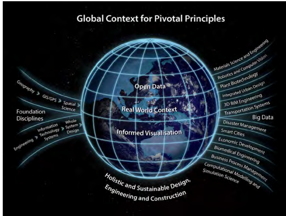
Figure 3. An illustrated ‘global context’ for the three Pivotal Principles

Fortunately, we have at our disposal an increasing array of robust tools. The Digital Earth community is using Earth observation satellites and spatially enabled technology integrated with sustainable-development oriented planning and engineering methods to enable local and regional organizations the ability to bring together the multitudes of digitally formatted data much more effectively. For example, Building Information Modeling (BIM) allows for sophisticated advance planning and cost-effective project development that attends to human dimensions for work and livable buildings and cities. BIM represents the new suite of life-cycle project engineering and planning tools that enable interdisciplinary teams to collaborate more effectively on sustainable and systems engineering projects (SIBA, 2015). Distributed, renewable energy systems and modern transport design not only revolutionize city flow patterns for better commerce, they improve health of the citizens and reduce carbon release to the atmosphere. Importantly, such projects are proving to be the most economically viable approaches to individual buildings and communities, while at the same time improving resilience to natural hazards and the impacts of climate change (Von Weizsacker et al, 2009; Plume et al, 2015).