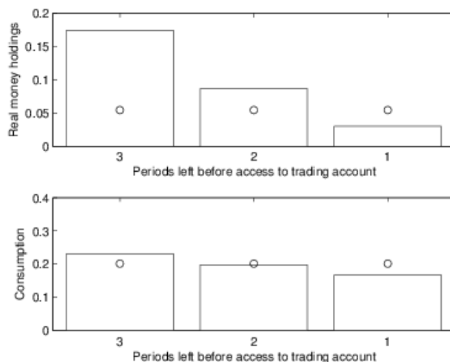
Figure 1: Money and consumption distribution under the infrequent trading model with \theta = 0 . Circles indicate the corresponding distribution under the classical case.

Infrequent trading case Let us consider first the case where \theta = 0 . Figure 1 describes the steady state distribution of money holdings and consumption decisions for the N p -type agents. Infrequent access to the brokerage account induces households to keep an inventory of money to pay for purchases for all the periods left before their next access to the brokerage account again. On average, unconstrained agents hold more money than if they had access to the brokerage account in every period. In this case the optimal inflation rate is 1.9% and 2.44% for N equal 2 and 3 respectively. Relative to the classical case under the RA assumption, inflation is now higher because infrequent trading raises money holdings, i.e. the inflation tax base, for any given level of consumption transaction costs.