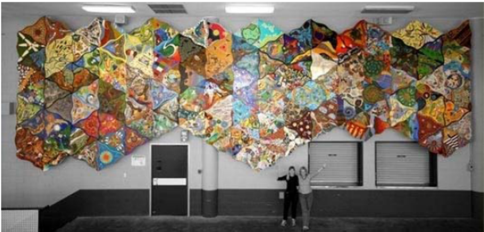
Cairns Past and Future