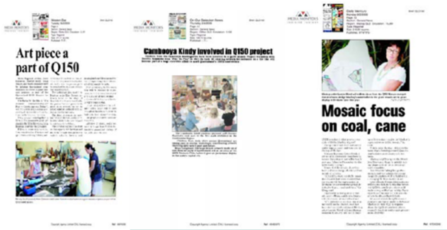
Media file: Press Release Articles