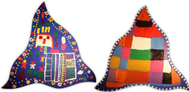
Mornington Island Past and Future

Thelma Burke also painted the tile reflecting her vision for the region's future. 'The black sections represent the diminishing number of old people and the coloured sections represent the new young people taking the place of the old people, leading Queensland in a new direction.' 13 ]