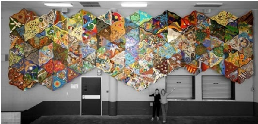
The Completed Mosaic

Many exemplary initiatives are continually proving to be successful in this area of public art as a catalyst in the process of linking communities and celebrating difference. Still in the main they remain city-centric and seldom draw in those ethnic minority groups in more remote rural areas. Needless to say this demographic will increase in numbers as we face the challenge of global warming, human displacement and forced migration. To this end the need to bring these communities together is paramount. It can be argued that the soft approach to this dilemma through non political non-biased creative art and design practices will only generate a more harmonious user-friendly community in the long term.