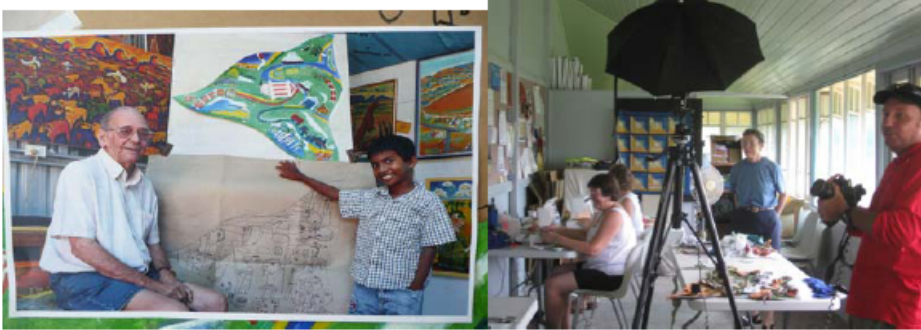
Participants: Harvey Bay and Townsville

While many responses were a collective effort both in the research and the creation of the finished artwork, some artists chose to work in relative isolation. Others collaborated with professional artist collectives, tertiary institutions, Secondary and Primary schools and in a couple of instances pre school centres.