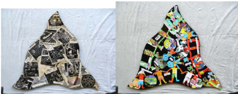
Logan Past and Future

'250,000 people with more than 58,000 residents ...migrants and refugees coming from more than 170 different cultural backgrounds. The colourful figures represent the diversity of cultures coming together in the future as a community sharing ideas and cultural backgrounds in a harmonious, loving and caring way, a city free of prejudice, discrimination and jealousy. .... Children were also invited to think about aspects of the local environment and how it might be affected by change, time and technology. Young people took care to consider how to protect and conserve their local areas in a positive, passionate and caring way. ...issues such as pollution, solar power, eco-friendly vehicles, water conservation and preservation, energy saving initiatives and lifestyles. Some innovative and creative ideas were thought through by our young residents – the future of our city is in safe hands!' 13]