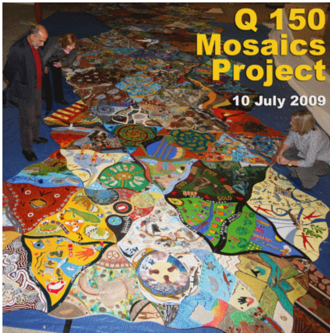
Q150 Mosaic a Work in Progress