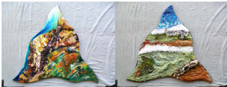
Townsville Past and Future

'The artists created drawings and wrote phrases, enticing the passing public to add their own words and images to demonstrate how they saw the spirit of Townsville. The group attempted to encapsulate the 'spirit of place' and the harsh beauty of the dry tropics and often-violent beauty of the landscape. The art celebrates and remembers the men and women who have lived in the city, the resilience of the original inhabitants and those who have come since. 13]