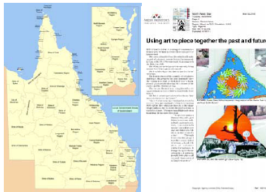
The State of Queensland, Publicity Reports

The state of Queensland is made up of 73 shires scattered over an area of 1.73 million square kilometers with about 4.2 million inhabitants. The shires constitute the parameters, the borderlines, which in Queensland work to facilitate manageable administration. The highest percentage of whom lives in the southeast corner of the state.