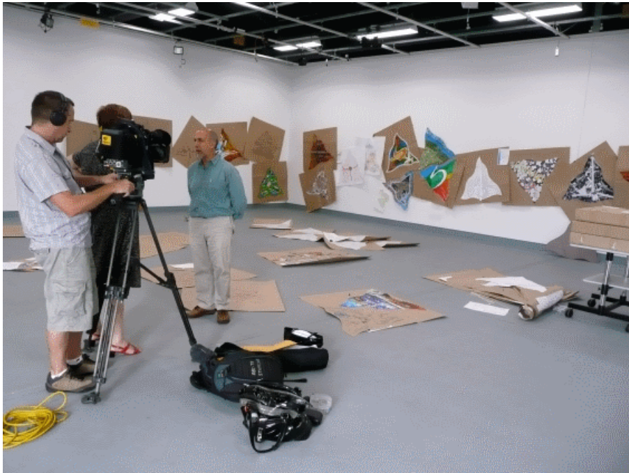
Works in Progress Exhibition ABC Interview for Landline