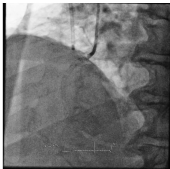
Figure 1 Thrombotic ostial occlusion demonstrated in the right coronary artery with TIMI 0 flow.