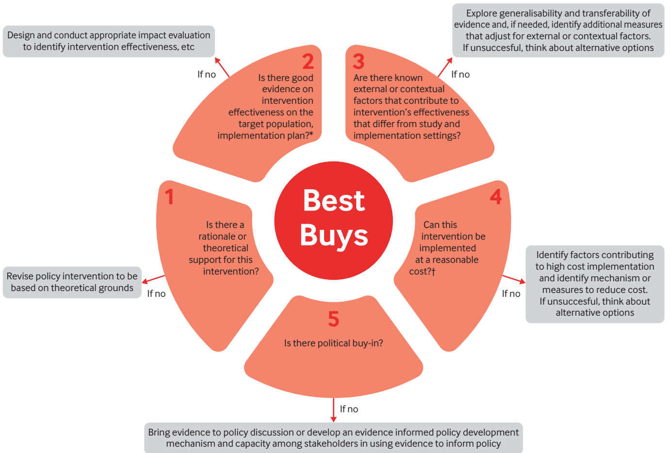
Fig 2 | SEED tool for determining whether an intervention is likely to be worthwhile in a local context. The tool has two sections: the inner circle aims to assist NCD programme managers in thinking critically about the intervention and the outer boxes provide recommendations for strengthening the evidence base. *Implementation=dosage, frequency, duration, coverage, etc, †Compared with the cost of implementing a similar programme in other settings or the costs in the economic evaluation studies used to decide to implement the intervention

evidence generated elsewhere to local settings is not straightforward, 14 22 23 25 we suggest using a scrutiny sequence starting with an initial environmental scan of the economic evidence (high or low income, organisation of healthcare, local prices, etc), followed by a data transferability assessment (see web supplement). 19 26 An institutional hub of national or regional technical expertise could support NCD managers in obtaining a clearer understanding of the local implications for health technology and transferability assessment.