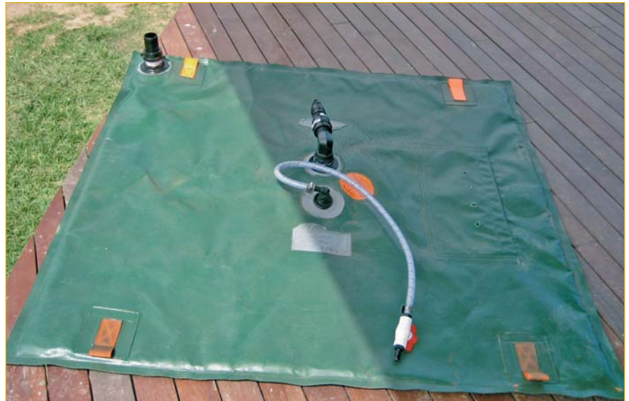
Figure 2. The 300 L storage bladder located under the house.

Odour problems have occurred due to poor design and where installations are not watertight. In projects where the UST are properly connected to the pipe system, these problems have not occurred. When connected and operating properly, residents from Swedish studies report that the odour problems in connection with UST do not appear to be greater than with other toilets.