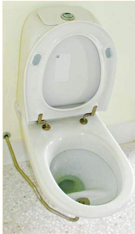
Figure 1. The Gustavsberg toilet selected for the trials.

In healthy humans, urine is a pathogenically sterile in the bladder (Johansson et al. 2002; Kvarnström et al. 2006). Freshly excreted urine normally contains different dermal bacteria. The most commonly observed pathogens excreted in urine of INFECTED patients are Salmonella typhi , Salmonella paratyphi , Mycobacterium tuberculosis , polyomaviruses,