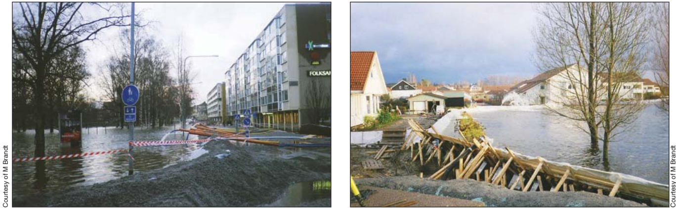
Figure 3. From November 2000 to January 2001, the town of Arvika and areas further downstream of the regulated Klar River valley in southern Sweden experienced a severe flood. The cost of repairing or compensating damage on buildings, infrastructure, agriculture, and fishing, and of the rescue work amounted to more than US$60 million.

Asia, the Ganges, Hai He, Liao, and parts of the Huang He and Amur in Asia, and the Australian Murray-Darling. Interestingly, a few basins that are expected to gain water under future climates will still remain severely water stressed (eg the Colorado, the Hindus, Hai).