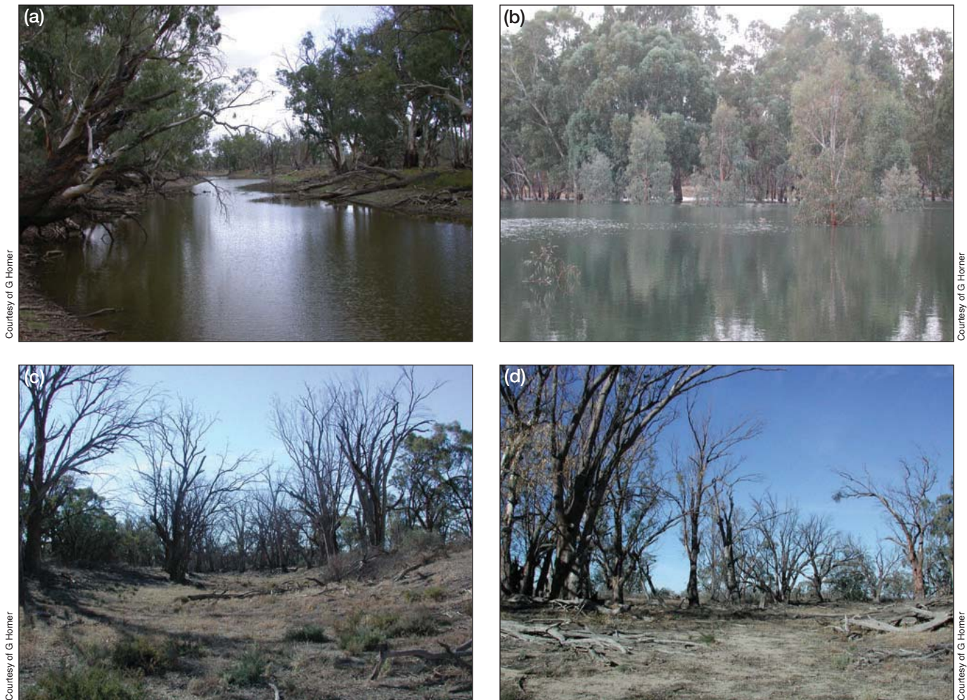
Figure 4. An example of proactive management, in which artificial floodplain inundation is maintaining river red gum ( Eucalyptus camaldulensis ) health on (a) Wallpolla and (b) Lindsay Islands on the Murray River floodplain in southeastern Australia. In neighboring areas of the Islands, (c and d) flow regulation and drought are causing widespread tree mortality. Reactive response will require widespread replanting and the forest will take decades to recover.

with increased discharge, projects involving additional stormwater control or modifications to dams or dam operation may be needed to protect ecosystems and people (Table 2). If these are not implemented proactively, rehabilitation projects to stabilize eroding riverbanks or reconfigure damaged river channels may be required and the costs may be high. In water-stressed areas, efforts involving wetland creation and floodplain reconnection may be needed to increase water retention and groundwater recharge (Figure 4). One could also imagine situations in which drier conditions lead to a need for stream banks to be stabilized or habitats improved (eg if the number of impoundments in the basin increased because of water shortages).