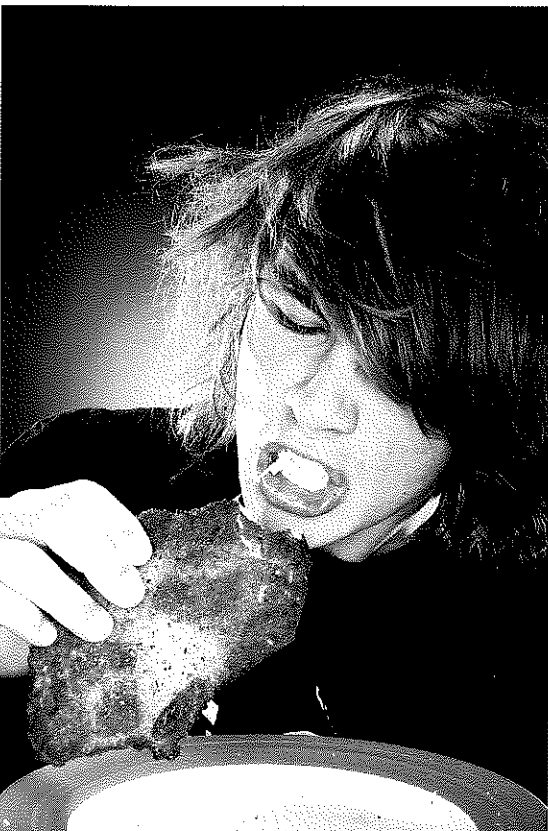
TOP & BOTTOM: Sol Salvation. All You Can Eat – Leigh – Chicken Schnitzel.

flink: We wanted something that would represent not only who we are and what we're about, but what we want to achieve. We saw the word "flink" on the pack of a spare fuse hanging on the back of a beat up old Elinchrom head we used to cart around. It's a little old Dutch/Swedish word that means "rapid, fast, bright, nimble, accurate".