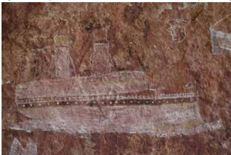
Figure 4: Painting of steamer from Djulirri.

One of the paintings that most drew our attention at Djulirri was the depiction of a steamer in profile with intricate detail including port holes and a bow wave (Figure 4). The style of this painting is very unusual for the art of this area. For instance, the angle on which the ship is painted and the possible alternative view of the same ship (Figure 5) suggest an artist with some training in European methods perhaps through their schooling on nearby Goulburn Island or at the Gunbalanya (Oenpelli)