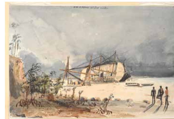
Figure 8: H.M.S. Pelorus at low water, 1840 (Owen Stanley, State Library of NSW).

In terms of the later adaptation to a steamship there are a few possibilities. These ships are possible candidates due to the limited number of single funnel, two masted ships navigating the north Australia waters. Twin masted steamships were utilised on the Overland Telegraph Line supply run to the Roper River depot in 1872. The SS Young Australian puts into South Goulburn Island in 1872 to wait out rough weather conditions and affect repairs after becoming waterlogged. From this time, Goulburn Island becomes known as a safe harbour with