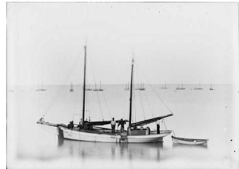
Figure 12: ‘Three men standing in pearling lugger on water, Palmerston [i.e. Darwin], ca. 1890’.

While some vessel types painted at Djulirri are represented by only an individual example, others are in abundance. Luggers are a case in point with many depictions at Djulirri, and other Wellington Range rock art sites, and hundreds of them operating in northern waters from the 1880s through into the 1970s (Figure 12). It is unlikely in these cases, unless some specific link can be made between a boat and an historical event depicted on the rock, that a positive match between the rock art and a single named lugger will be found.