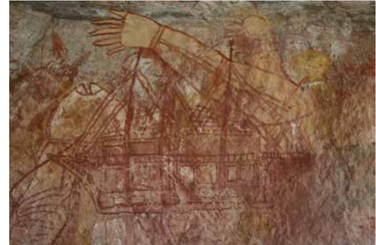
Figure 7: Layered painting of ships from Djulirri, northwestern Arnhem Land.

As with other rock art across Arnhem Land, a seemingly straightforward painting of a ship is actually very complex. On publication of an earlier article 21 this image (Figure 7) and its caption attracted the attention of a number of maritime historians and archaeologists. What many failed to recognise (and what was very difficult for non-rock art researchers to see from a small photograph in a journal article) was that this image was not produced in one sitting and probably not by any one artist but is the product of layering and retouching or reworking original images to produce something different. 22 This is not uncommon in rock art of western and north western Arnhem Land (or in other areas of Australia such as the Kimberley).