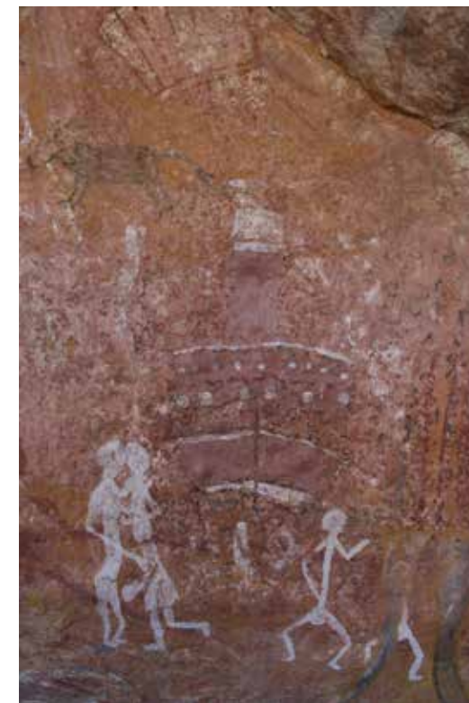
Figure 5: Front view of ship painting from Djulirri, possibly the same ship as depicted in Figure 4.

detail and the use of perspective and colour all add to the uniqueness of this image.