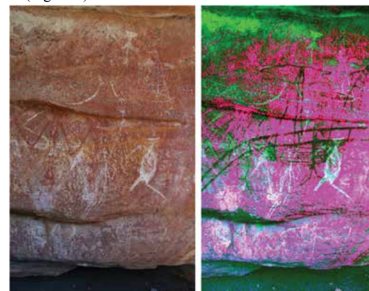
Figure 3: Yellow painted prau from Djulirri (left) and enhanced version (with DStretch) of the same image (right) showing the prau underneath other paintings and beeswax figures.

and regular fleets of prau sailed in with the northwest monsoon each December and returned home with the southeast trade winds around March or April. 8 These seasonal visits ceased around 1906. 9 During their visits, the Macassans are thought to have developed close social as well as economic ties with the local Aboriginal groups across coastal Arnhem Land and including Groote Eylandt. 10 Abundant accounts have reliably noted that Aboriginal men worked as crew aboard Indonesian sailing vessels. 11 The yellow painted prau at Djulirri is currently the earliest rock art evidence we have for Macassan contact with Australian shores 12 (Figure 3).