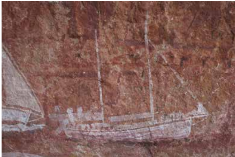
Figure 13: Rock painting of a lugger from Djulirri.

the Northern Territory Times and Gazette contain references to luggers being utilised as general purpose maritime workhorses in northern Australian waters, supplying buffalo shooters, missions, and customs stations.