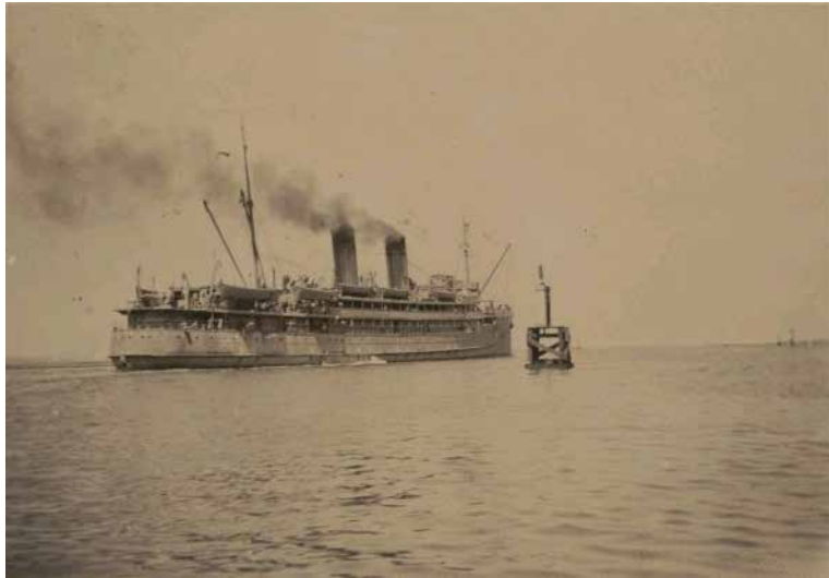
Figure 6: Possibly a modified MV Neptuna in c.1942, a ship similar to that painted at Djulirri and depicted in Figures 4&5.