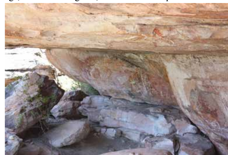
Figure 2: General view of one section of the Djulirri rock art complex, Arnhem Land.

Maung language name for a series of rock shelters that adjoin each other and overlook a long valley of other painted rock shelters. It sits approximately 20 kilometres from the coast in the Wellington Range sandstone massif which is surrounded by coastal plains and a number of small to large rivers that feed out into the sea. It was important to the team that all surviving rock art at a site was documented, not just the contact period art or the introduced subject matter such as ships, horses and guns. This allowed us to analyse contact art within its full rock art context. At just the main gallery of this site over 1100 individual rock paintings, 46 beeswax figures, 17 stencils and 1 print were documented.