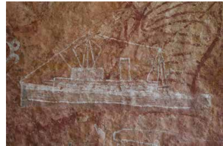
Figure 10: Rock painting from Djulirri, possibly a naval vessel from World War Two.

with HMAS Gayundah , one of two sister ship gunboats purchased by the Queensland colonial administration in 1884 and subsequently transferred to the Australian navy. Designed for coastal defence, the ship had a very low freeboard fore and aft, with a forward gun mounted within the main superstructure, and a rear gun in an open turret, together with lighter armaments. She had two masts and a single funnel, though at the time she was in Northern Territory waters in 1911 her forward gun had been removed, and from 1914 her bow had been built up to increase seaworthiness.