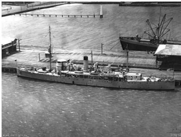
Figure 11: HMAS Moresby (Australian War Memorial P02305020 and 301056)

A more likely possibility than any of these is that the image is of HMAS Moresby , a survey vessel based often in Darwin (Figure 11). Moresby , built as a 24 Class Convoy Sloop HMS Silvio in 1918, was acquired as a survey vessel for the RAN in 1925 and carried out much survey work in northern Australia before being sold in 1947. The vessel was 276.5 ft long, and 1650 tons. The ship had a flush deck, like the painting, one deck of accommodation, raised bridge, single funnel, two masts and projections (crane spars and awning frames) forward and aft of the superstructure. She had a vertical bow and stern, and carried a variety of guns in different positions at different times. If the painting does in fact depict HMAS Moresby , it would suggest a close association in dating between the images making up the panel of several vessels and a bi-plane depicted at Djulirri — all could have been operating in the region in the 1930s.