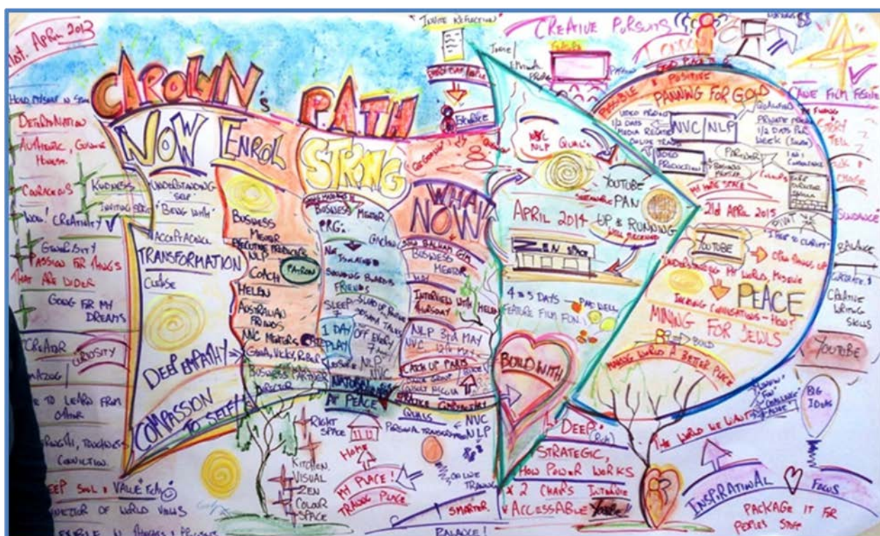
Figure 3 The focus group PATH facilitated by Matthew Armstrong and Wendy Chandler, Planning Facilitators (graphic used with permission).

The findings (including the path image in Figure 3) offer insight into PATH and its potential to support wellbeing and recovery. Participants reflected both from a lived experience perspective of overcoming distress as well as practitioners and leaders within mental health services. The authors were acutely aware of the privileged information that had been shared with them of being “the voice of the participants” (Krueger & Casey, 2009, p.126) when completing the analysis of data and completing this study.