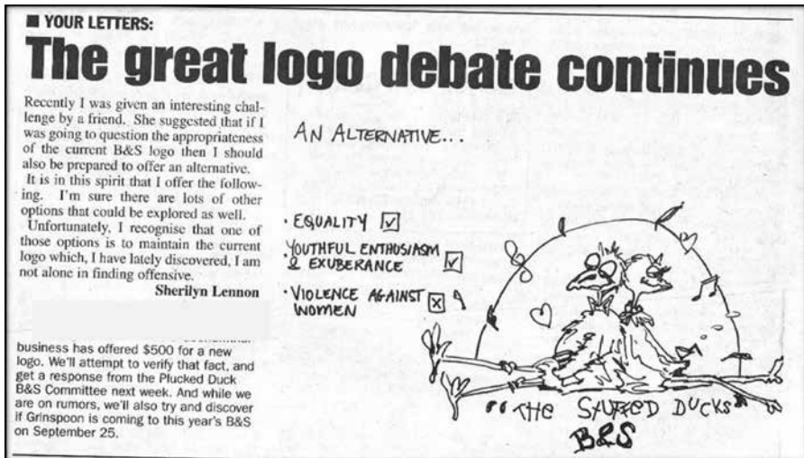
Figure 6.4. My second letter is published.