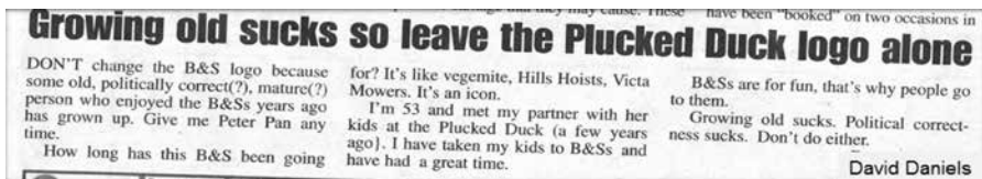
Figure 6.6. The debate continues.

I wonder if the ongoing gender debate in the editor's paper has had any influence on the position he has taken. There is also another letter to the editor regarding the logo (see Figure 6.6).