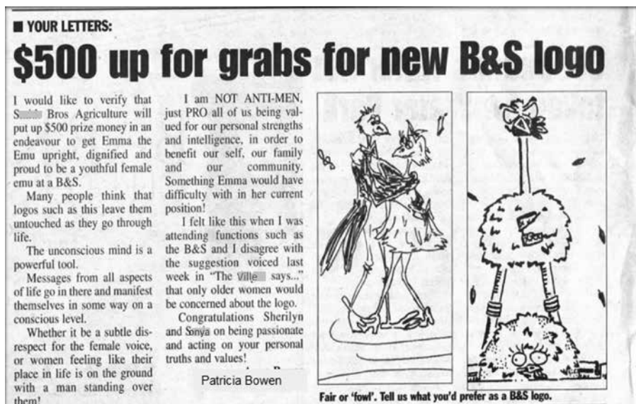
Figure 6.5. Another alternative and a financial incentive for change.

Wednesday, March 24: My colleague’s letter to the editor is published (see Figure 6.5). Again the original logo has been inserted.