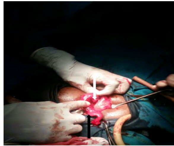
Fig. 1 Intraoperative view of right pyosalpinx (black arrow) adhered to the terminal ileum and caecum obstructing the lumen of an inflamed appendix (white arrow)

The patient was therefore placed on intravenous (IV) antibiotics and the post-operative period was uneventful.