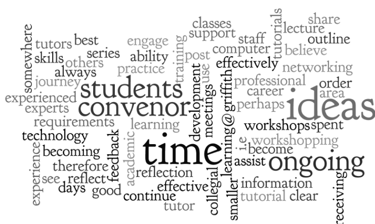
Figure 3: Resources required to build the capacity of sessional teaching staff

When respondents were asked: What would assist you to become a more effective teacher? a number of ideas including having meetings with the course convenor and gaining feedback from course convenor during the semester that could be classified under the broader theme of ‘collaboration and collegial support’ were listed. Figure 3 reports on the results of the question: The area/s I need to further develop is/are. Responses to this suggest that respondents required more time to collaborate and develop technological skills to improve their effectiveness as a teacher. Skills in the use of technology, were deemed necessary to network academic staff and communicate with students. Respondents saw technology as a conduit for effective collaboration and for sustained collegial support. Yet other data clearly indicated that lack of time and outside employment (17 respondents indicated that they currently have other paid employment outside of their university work) adversely impacted the opportunity for building such capacity.