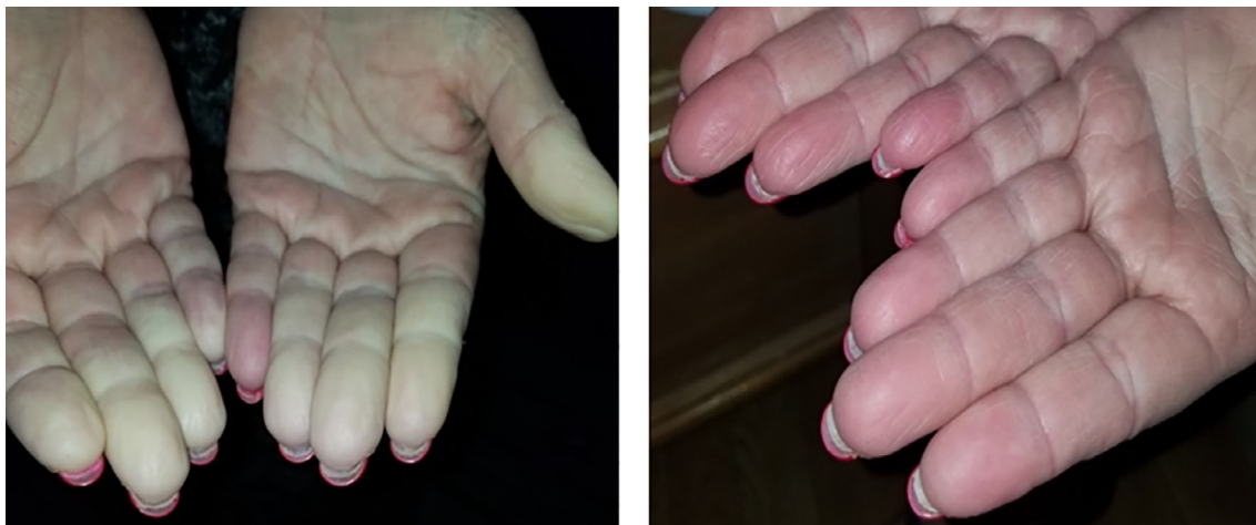
Figure 1. Images of patient's Raynaud's episode during cold and rewarming.

investigation include pre-existing systemic and organ-specific autoantibodies, including antithyroidal antibodies [2], as well as peripheral blood cellular ratios [3].