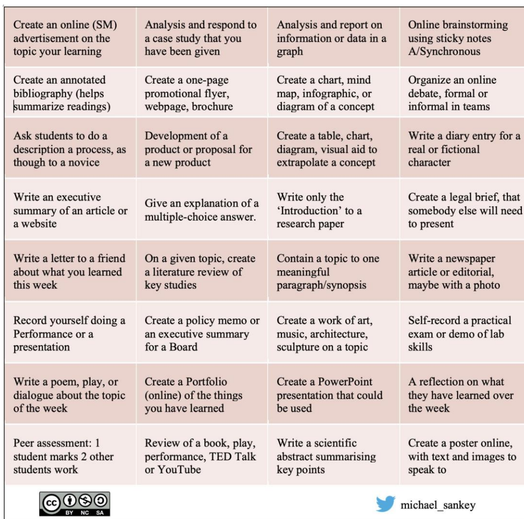
Table 1: Some different forms of assessment/activities

In Table 2 we now outline or unpack some of the different activities/assessments seen in Table 1 and the types of tools and tips that could be used to undertake these tasks. These are only examples, and it is really up to the imagination of the teacher as to other tools that may be used to achieve similar outcomes. However, it is hoped that these seven examples might also help stimulate thinking around what other assessments might also be achievable in these different tools and that, importantly, assessment doesn't have to be an essay or a quiz, as it can take whatever form helps students understand the concepts at play in their courses.