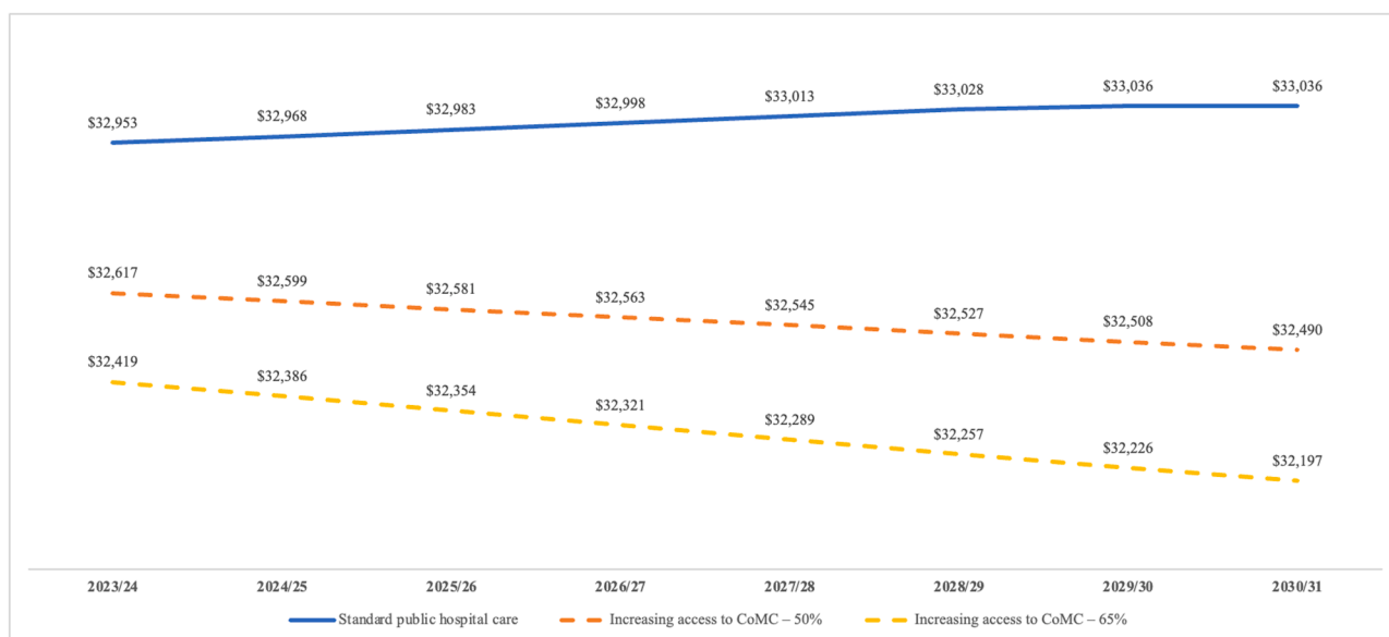
Fig. 2. Mean total costs per pregnancy to public hospital funders if increase access to continuity of midwifery carer – all projected women giving birth in public hospitals, Queensland, Australia, 2023/24 – 2030/31. Abbreviation: CoMC = Continuity of midwifery carer. $ = AUD 2021/22.