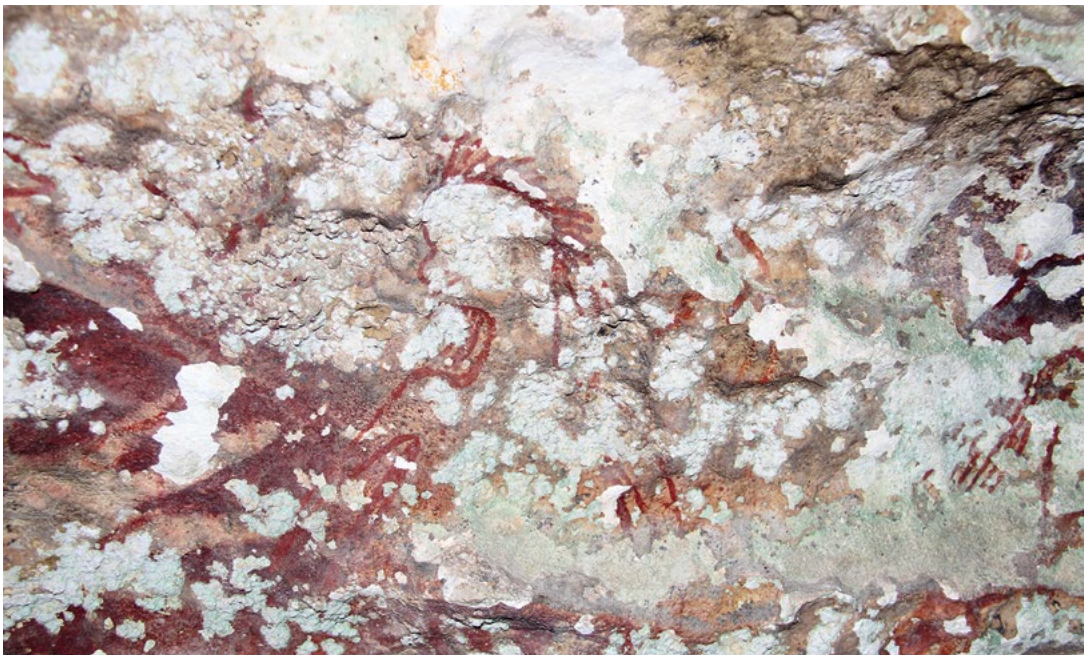
Figure 4.3: Intermediate red painting of a human figure from Leang Jing.

For instance, at some Maros sites there are rare small paintings of humans and animals in red outline that are very different to the earliest red rock art referred to above and late Holocene charcoal designs. A number of these can be found at the Maros area site Leang Jing (see Figure 4.3). Our initial impression, based on superimpositions and other field observations, is that they appear to be more recent than the old, large animal paintings and stencils. Were these ‘intermediate’ images made by the Toaleans? We do not have direct dates, so this art needs to be dated and further investigated.