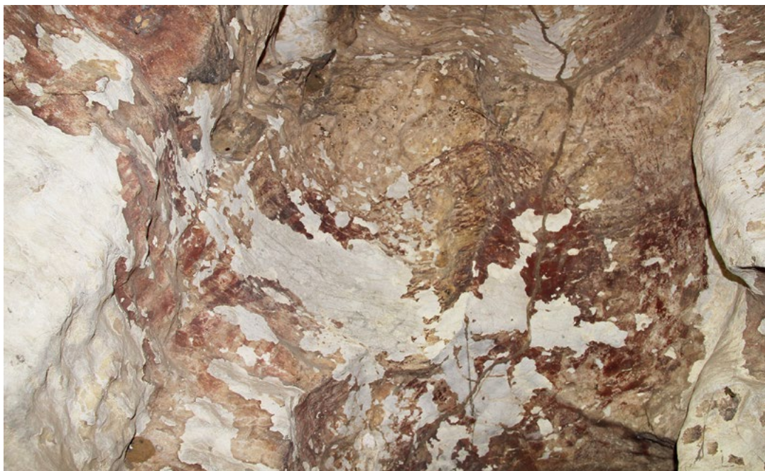
Figure 4.8: There appears to have been an increase in flaking of limestone surfaces since the 1980s, damaging paintings, stencils and drawings in the process.

(d) There are local people who look after rock art sites and some sites have signs and locked gates but future tourist pressure will require revised management and conservation plans. This could include a 3D scanning program of the more important sites so that should something catastrophic happen to them a detailed permanent record would be available for replication.