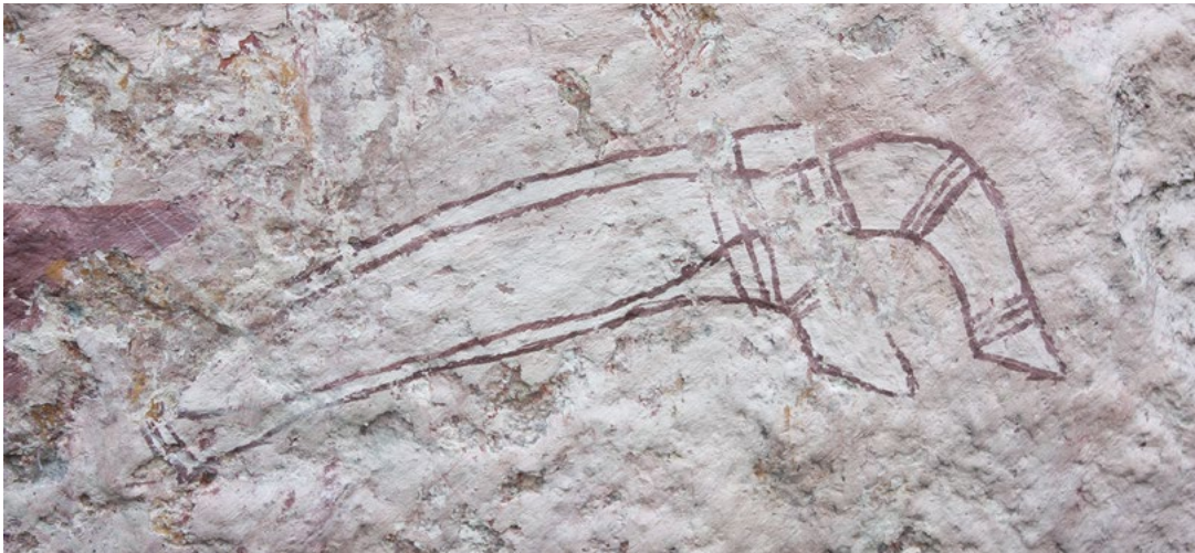
Figure 4.6: Rock painting of a badi' (a type of iron dagger from Southwest Sulawesi) at the Malarrak site, Wellington Range, northwest Arnhem Land.

For instance, the Malarrak rock art site has paintings of a perahu sailing boat, a badi' (a type of iron dagger from Southwest Sulawesi; Figure 4.6) and possibly a monkey in a tree (Taçon and May 2013; but also see May et al. 2013 for interpretation that a quoll might have been depicted). A second site, Djulirri, has a white perahu with a minimum age between AD 1644 and 1802 (median age of 1777) 2 as well as a large yellow painting of a perahu that is older. The perahu painting is under a beeswax snake that was radiocarbon dated. The beeswax snake has been Carbon-14 dated to AD 1624–1674 (94% accuracy; using OxCal4.1) or 1517–1664 with a median age of 1577 (99% accuracy using IntCal09) (Taçon, May et al. 2010). 3 This sits comfortably with results from recent excavations at a Macassan trepang processing site on the nearby coast that indicates people from Macassar were visiting as early as AD 1637 (Wesley et al. 2016).