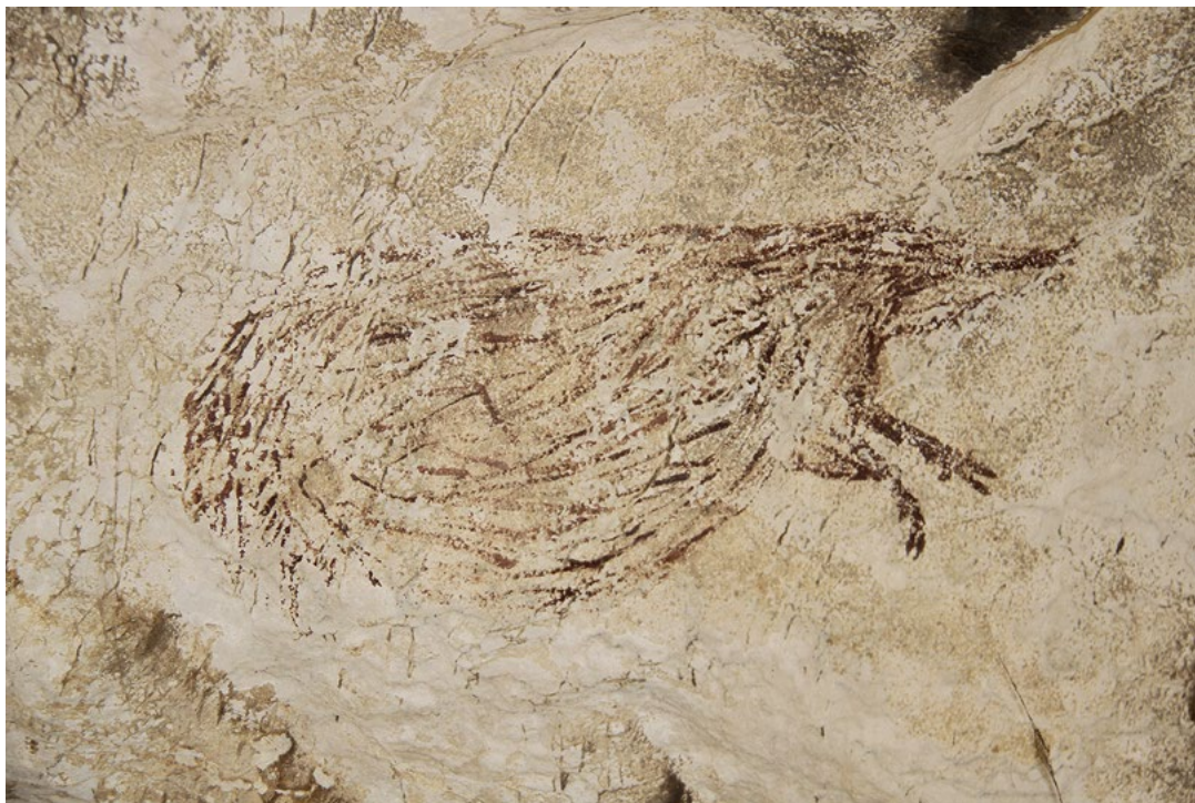
Figure 4.1: Early painting of a possible babirusa similar to one dated to over 35,000 years ago.