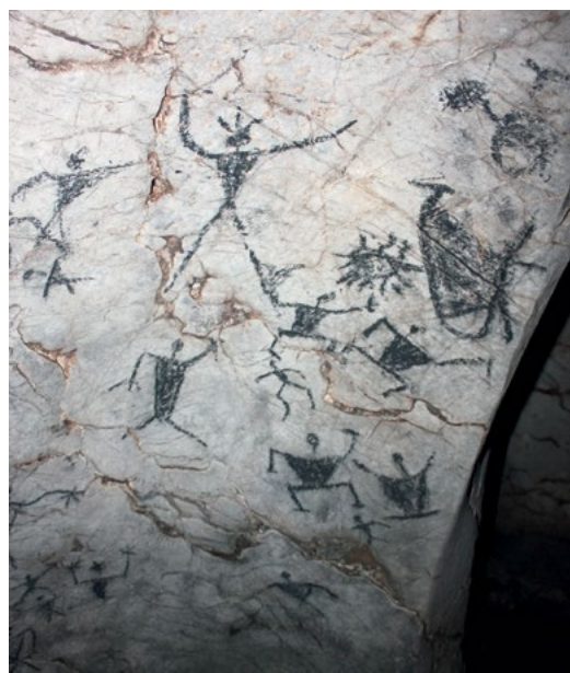
Figure 4.5: Charcoal human figure from Gua Sireh, Sarawak, Malaysia.