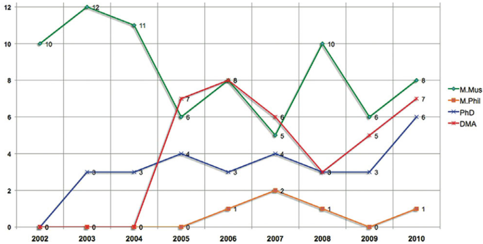
Fig. 1 QCGU Research Higher Degrees new students commencing, 2002–2010

research methodologies, or to cite a recent proposition, ‘from hunter-gatherer culture [borrowing from other disciplines] to agricultural culture [growing your own]’ (Dejans & Vanmaele, 2009).