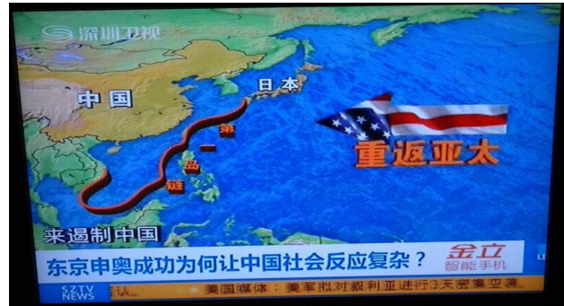
Fig. 3: Chinese perception of the US Pivot to the Asia-Pacific and ‘First Island Chain’ as its primary defense perimeter

The danger produced from this antagonistic interaction reinscribed the boundary between ‘East’ and ‘West’ along the former perimeter of defence against the Communist Threat, originally drawn by former U.S. Secretary of State Dean Acheson in January 1950. 12 Hence, the Korean Peninsula, the East China Sea, Taiwan - and the South China Sea - continue to be contested frontiers in the ostensible civilizational struggle. This bordering effect became visible in the way the Obama administration implemented its pivot to the Asia-Pacific, and in how it was perceived by the leadership in Beijing (Fig. 3).