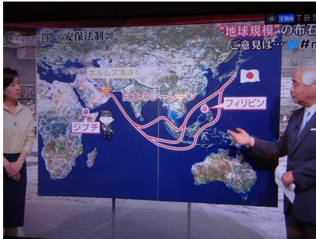
Fig. 4: The portrayal of SLOC as vital for Japan’s national security in debates about legislative and constitutional change for allowing overseas military deployments.

On the one hand, China’s economic catching up shifted and challenged the cognitive boundaries that had long differentiated the developed ‘West’ from the developing ‘East’. Established actors’ resistance to this reordering of the mental map accentuated bordering practices that aimed at reinscribing the ‘East’-‘West’ division. This, in turn, strengthened the Chinese leadership’s resolve to accelerate the ‘rejuvenation’ of the country, such as through the proclamation of the Belt and Road Initiative (BRI) in 2013. It also triggered the decision to embark on massive land reclamation in the Spratlys with the aim of creating a military buffer zone in the South China Sea. On the other hand, the US and especially its Australian and Japanese allies, worried about Chinese moves and, anxious about declining US power, reached out to new partners. To India in particular. Various initiatives for militarily securing ‘freedom’ and ‘openness’ across the ‘Indo-Pacific’ emerged. Following, countering, and mirroring the BRI, these came to encompass strategies for