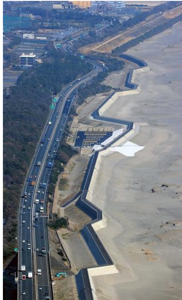
Fig. 1: Breakwater along the coastline in Hamamatsu, Shizuoka Prefecture, Japan

ecological sustainability that are crucial for future prosperity.