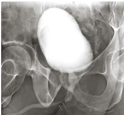
Figure 3. A retrograde urethrogram demonstrating a mid-distal bulbar stricture

The earliest recorded treatment of urethral strictures originates from Sushruta, the founder of Ayurveda medicine