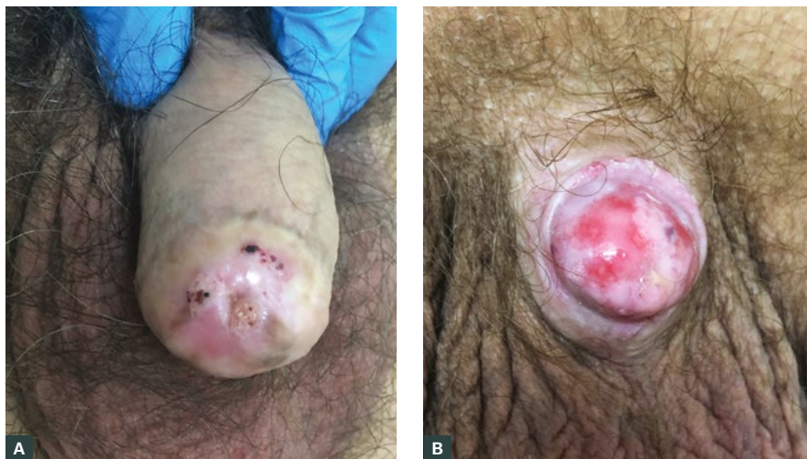
Figure 2. Images of lichen sclerosus A. Penile skin; B. Glans penis

If untreated, urethral strictures can lead to significant complications including elevated post-void residual bladder volumes, a thick-walled trabeculated bladder, acute urinary retention, hydronephrosis, calculi formation, renal