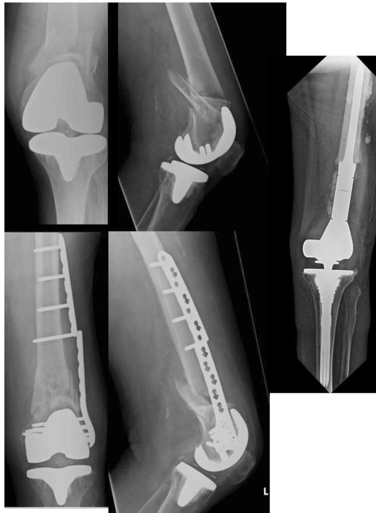
Fig. 2 Case example. In this case, the patient received a locking plate via an open technique with indirect reduction. The patient proceeded to non-union at 6-month follow up with consequent plate failure and was revised to distal femoral replacement

commend the practice of allowing full weight-bearing after treatment of distal femoral fractures, especially in elderly patients where avoidance of prolonged bed rest and its associated complications is desirable. This should be a standard of care in management of the elderly and future research efforts are needed to increase the clinical weight of evidence for this practice.