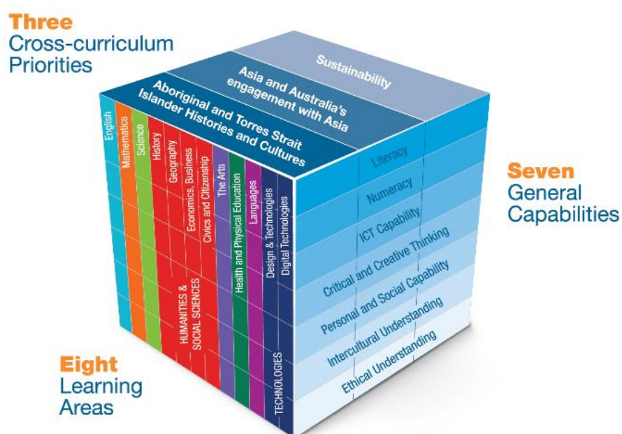
Figure 1: Three dimensions of the Australian Curriculum

Reporting Authority (ACARA) became operational in 2009. ACARA wrote several key documents, such as The Shape of the Australian Curriculum (2009), Curriculum Development Process Version 6 (2012a), and Curriculum Design Paper Version 3.1 (2013a) to develop and implement the Australian Curriculum. ACARA used the broad outline from the Melbourne Declaration on Educational Goals for Young Australians (MCEETYA, 2008) to establish the three-dimensional design of the Australian Curriculum: learning areas, capabilities, and cross-curriculum priorities, as depicted in Figure 1.