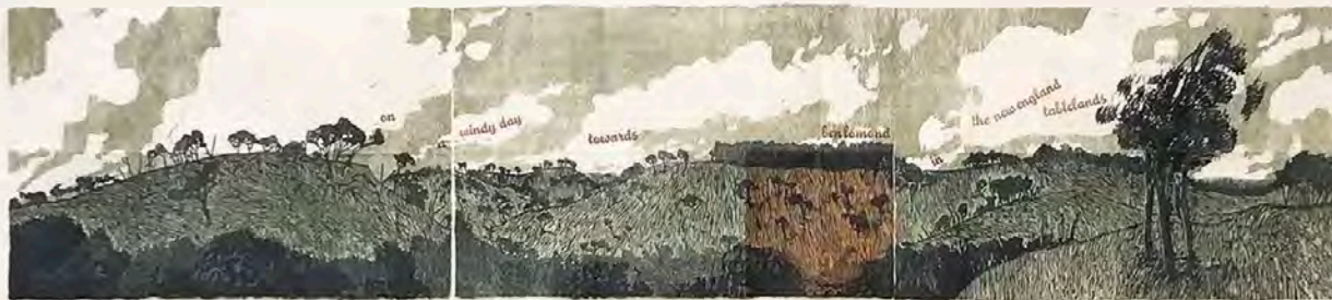
print triptych, colour reduction woodblocks prints and letterpress on Awagami Kozo, 300 x 64 cm, 2018, (variable edition of 3)

exhibited in, the Residents New England Regional Art Museum, Armidale, NSW, 2019