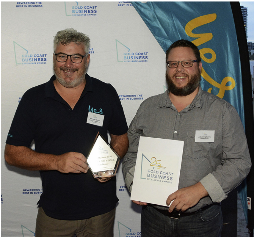
Fig. 2. Gold Coast Business Awards for Excellence – Family Business for Plant Doctor in 2019.

All businesses are family-owned and operated. The companies including the Plant Doctor pride themselves on old-fashioned customer service and aim to make this their unique value proposition. In 2019, 2020 and 2022, Plant Doctor won the Gold Coast Excellence Award for Family Business (see Fig. 2).