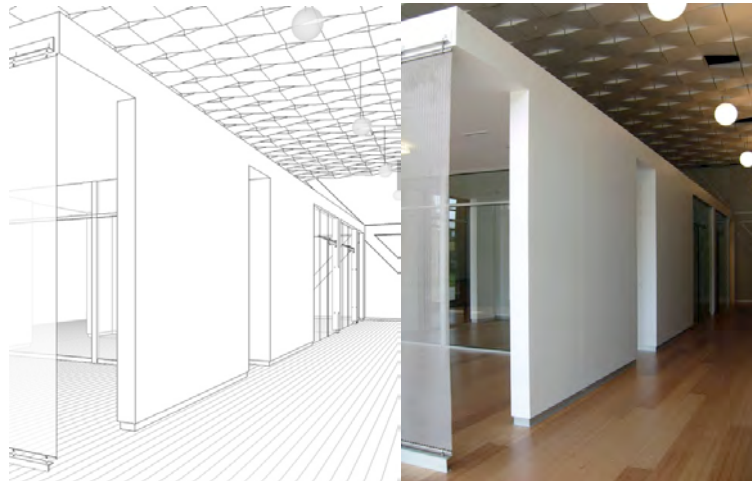
Figure 1. Left: Computer generated perspective drawing (labelled R1 in the experiment). Right: Digitized photograph of the same space (labelled R0)

During the experiment participants were asked to complete demographic questions regarding their gender, age and first language. They were required to look at two images shown on a screen (Fig.1): the first (R1) is a computer generated perspective drawing, the second (R0) is a digitized photograph of the same space when built. When they looked at the images, their eye-tracking data were recorded by an eye-tracking system (Gazepoint in USA and Tobii studio in China). Each of the images was shown for 20 seconds with a few seconds for recalibration in between them. Half of participants were first shown R1 then R0. The other half was first shown R0 then R1. After each image session there was a questionnaire session. Data collected included eye fixations and saccades.