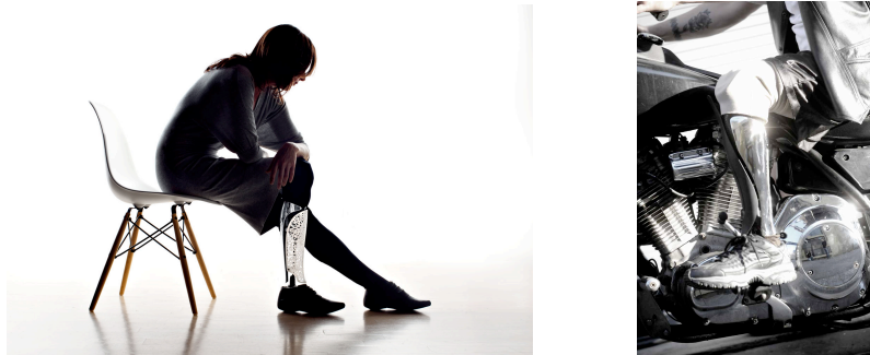
Figure 3. Bespoke Innovations product designers use 3D printing for customised prosthetics

people who have congenital or traumatic limb loss' [9]. This product design company developed individual prosthetics for their clients to meet their emotional needs as well as their individual functional needs; for example, the design of a leg prosthetic for a footballer, or a cyclist differs from the leg most suitable for a motorcycle enthusiast. This level of customisation allows for innovative thinking, such as designs that go beyond replacement into enhancement.