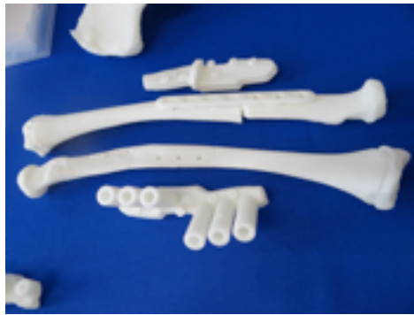
Figure 1. Surgical guides are developed using 3D printed practice bones and 3D printed

surgical procedure, he develops surgical guides that are also 3D printed, that can be inserted onto the bone to ensure the cut is accurate to the planning [4].