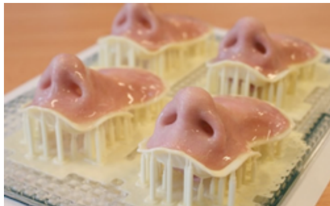
Figure 4. Fripp Design and Research collaborate on the design of 3D printed soft tissue prosthetics

For product design educators, preparing students for work on emerging medical design applications, based on innovations in digital media, involves not only helping them to develop new practical skills to an advanced technical level but also develop specific relationship skills aimed at promoting effective collaborations between designers and clinicians. Promoting a shared language, culture of design development and understanding of practice will support genuine collaboration, over a clinician / technician relationship, that is more likely to lead to innovation. It does require commitment, but there are opportunities emerging that suggest it will be a worthwhile development for product designers for the future, taking their work in unexpected directions. Fripp Design and Research is an example of a product design consultancy exploring these new, collaborative directions. Fripp Design and Research is a Sheffield based consultancy who work with the University of Sheffield and the Wellcome Trust to develop improved soft tissue prosthetics from a user point of view [10].