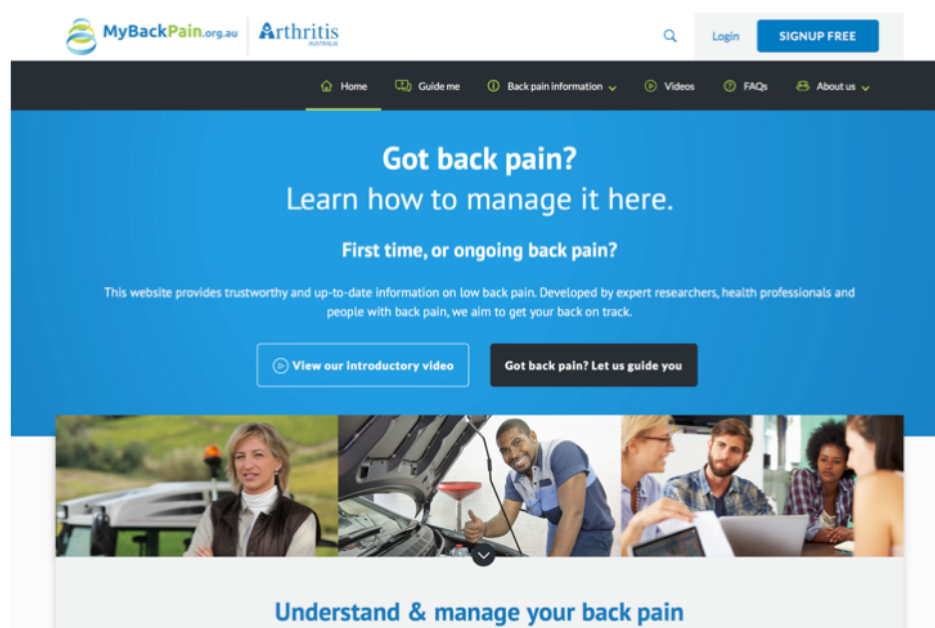
Figure 3. Screenshot of landing page for MyBackPain, an internet resource designed for people with low back pain to obtain information about their condition and guidance for managing/living with low back pain.