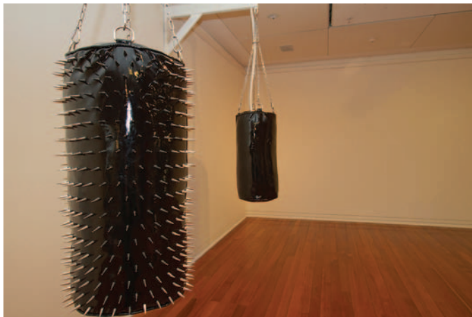
Figure 5. Duo of punch bags Jab and Shiner , materials, Wet look vinyl, stainless steel spikes, chains and electronic components.