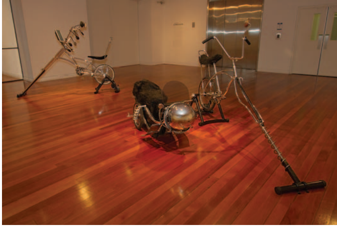
Figure 2. Foreground - Lower than Lowrider and a Sidecar named Desire , Materials, 'Pimped out' lowrider bike, chromed steel, and fake fur. Side car named desire: Chromed steel, aluminium, 1960's beehive salon hairdryer; fake fur and DVD infomercial.

Background: Low - Fat Lowrider ; Materials 'pimped out' lowrider bike, polished aluminium, chromed steel, velvet and electronic and computer components.