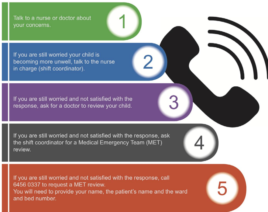
FIGURE 1 Calling for Help

Theoretical Domains Framework: knowledge; skills; social/professional role and identity; beliefs about capabilities; beliefs about consequences; memory, attention and decision processes; environmental context and resources; motivation and goals; and behavioural regulation. Using this theoretical approach supported systematic identification of key human and system factors that had influenced the introduction of C4H. A multifaceted implementation strategy was then developed to address the key issues, recognizing that to change behaviour the selected strategy should draw on theories of behaviour and behaviour change. 24 Implementation strategies are more likely to be effective if they target causal determinants. The Michie et al matrix 24 and Cane et al hierarchy of behaviour change techniques 25 guided the researchers to select implementation strategies that were appropriate to address the issues and also relevant and appropriate for the study context.