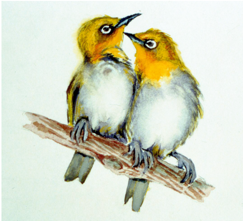
PLATE 1. Allopreening Heron Island Silvereyes. Illustration credit: Jiro Kikkawa.

on breeding performance (compare posterior means of c_2 , c_3 , and c_r in Table A1). The latter similarity suggests that there may be some degree of confounding between male and female influences on breeding performance.