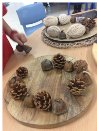
Figure 2a. An E patterning activity with natural materials showing an AB pattern.