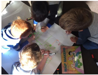
Figure 3a. Children read a book and drew a map as part of an E activity.