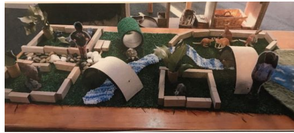
Figure 3b. A 3D model of the zoo from the app as an A experience.