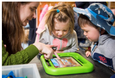
Figure 2b. Children playing the patterning game (R).