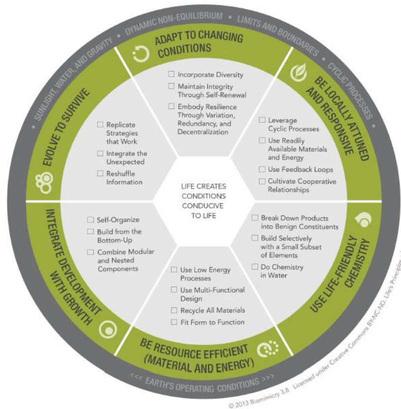
Figure 2. Life’s Principles (Biomimicry 3.8, 2013)

These regenerative patterns and strategies reflect recurring characteristics of life (written large) in ecological systems. Looking at these and others (such as Pedersen Zari (2018) Ecosystem Process Tiers) relative to key elements of socio-ecological resilience, it is evident that there are many overlapping and aligned principles, including multifunctionality, real-time feedback loops, evolution and adaptation, and self-repair. Given that biomimicry has developed clear and actionable frameworks for transferring strategies from biology to design and engineering, it may well provide a useful guide for pursuing socio-ecological resilience attributes in infrastructure engineering – establishing a tangible stepping stone for shifting resilience approaches from a solely ‘engineering resilience’ approach, to one which aligns with a socio-ecological resilience perspective.