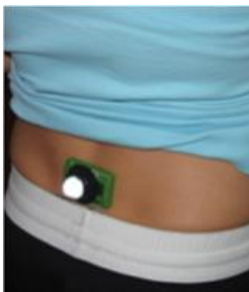
Figure 2. Typical sensor placement at S1 of the sacrum.

Analysis of high-speed camera data was carried out by observation of captured sessions. This involved identifying video frames where initial ground contact was made and where the contralateral toe off occurred. The high-speed camera-capture method identified 57 illegal steps with flight and 23 legal steps for a total of 80 steps. The data on these steps were compared with the sensor-captured data on the same steps. The data were converted to time (in seconds) of loss of ground contact by the following the equation: