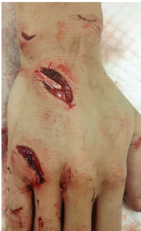
Fig. 3. A patient who presented during the study period with a complete transection of the extensor digitorum communis tendon to the ring finger of the right hand.

small lacerations can have extensive injuries to the deep structures underneath. 2,8,10 Tuncali et al 2 examined 226 patients with small lacerations (<2cm for hand and <3cm for forearm) and found that 59% of these patients had an injury to at least 1 deep structure (either tendon, artery, or nerve). Provencher et al 9 found that the preoperative examination, even when performed by a trained orthopedic hand surgeon, underestimates the extent of the injuries in 94% of patients. Therefore, even after a normal clinical examination, the treating physician should have a low threshold for taking the patient to theatre for formal exploration and repair if required. This is potentially an area of improvement for the studied institution, as 91 of 137 patients with punching glass injuries were discharged home without a formal exploration in theatre. Appropriate imaging of the injured area should also be performed to assess bone integrity and to identify the presence of a retained foreign body. 13