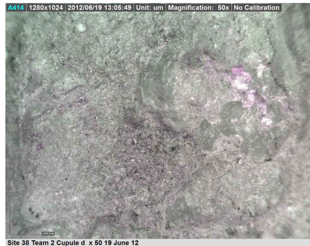
Figure 6. Centre of cup-shaped hollow D. Use-wear 50×. Note polish and rounded grains.

A cup-shaped hollow D is located on the floor of a crevice, opposite the main cupule wall. The hollow is associated with sparse sediment and animal droppings. Its diameter and depth (5/0.3 cm) fits with tested cupules; however, it differs through separation from the main body of petroglyphs and variation observed in use-wear (i.e. level/polished rather than uneven/