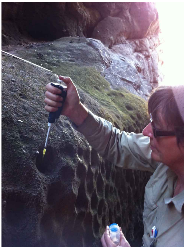
Figure 4. Janet Davill assisting with pipette extractions on the cupule wall (cupule A, panel 1).

topography, modifications of individual rock matrix grains, striations and polish) (see Stephenson 2011 for details). Lifts were performed to extract samples (including residues) from the matrix of the investigated surface using a variable volumetric pipette. The pipette delivered 20 \mu l aliquots of ultra-purified water to a porous area on the investigated surface (a crack or pitted section; Fig. 4). The solution was left to soak and then the process was repeated over a 10 to 15 minute period. Water from a second pipette was then used to agitate the lift surface area and draw back a sample of matrix from the lift section. The samples containing residues were then placed in eppendorf tubes, sealed, labelled and transported back to the laboratory for residue analysis. The lifts were transferred to microscope slides and dried before undergoing a series of biochemical staining using picosirius red (PSR) and phloroglucinol (see Stephenson in prep. for details).