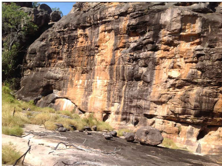
Figure 1. The western entrance to the cupule site (fissure to left of photo) and surrounding site complex, including stone arrangements and rock paintings (in natural recess near fissure, at base of outlier). Photo DW.

combine to reveal important cultural associations for the Djawumbu complex.