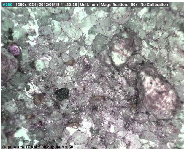
Figure 5. Centre of cupule B. Use-wear 50×. Note uneven surface with raised crystals, missing grains and unmodified areas.