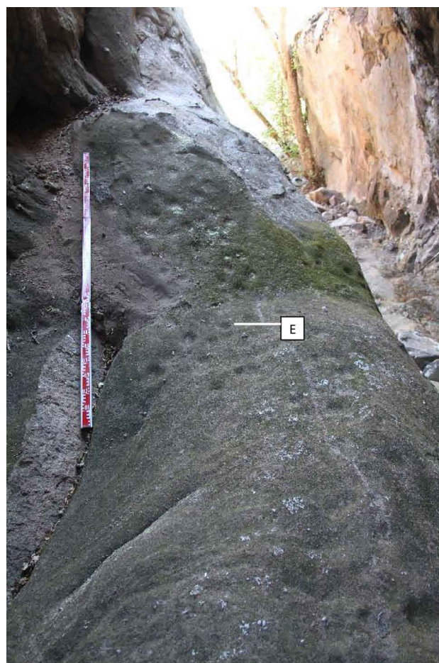
Figure 3. Panel 2 facing west towards the entrance with features chosen for residue analysis.

Use-wear and residue analysis was conducted on cupules from panels 1, 2, a cup-shaped hollow (D) in the cave mouth and one of the three feature lines observed on panel 1. Use-wear analysis was conducted in the field using a hand-held Dino-Lite (AM413T USB digital microscope) at a magnification of 50 times. In broad terms, the microscope was used to examine evidence for surface modification (e.g. changes in surface