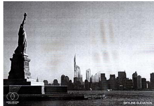
Figures 4 & 5. Lower Manhattan site for Museum of Living bodies and view of Freedom Tower I relation to Statue of Liberty.

The design that was awarded the bid for the Ground Zero, Freedom Tower is a good example of the tendency in architecture to make materials, things and spatial relationships operate within a discursive system of meaning. Daniel Libeskind’s Freedom Tower, as Ben Basin has accurately observed, is image-oriented, symbolic and predominantly visual in the position it takes on the skyline and in relation to the Towers it commemorates. I would go further to suggest that it monumentalises the past perspectively and provides a logo for a brand of freedom based on nostalgia. Its functionality is symbolic function of cultural commodity. In this way material constructions are primarily photo-opportunities that have been wedded to conspicuous consumption. Basin’s critique deploys Lefebvre’s