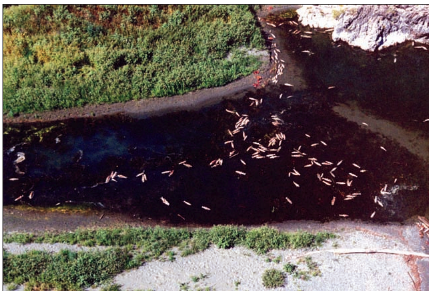
Figure 1. Dead salmon in the Klamath River, September 2002.

Already, scientists in North America, South Africa, Australia, New Zealand, and Europe are actively advising the public and river managers on the necessary quantity and timing of river flow needed to maintain desired ecological characteristics. Such advice is being provided in diverse political contexts, ranging from the cooperative to the controversial. In the US, scientists have helped guide efforts to recover endangered species in rivers like the Klamath, the Colorado, and the Missouri (NRC 2002b), to restore degraded flagship ecosystems such as the Florida Everglades (Holling et al. 1994), and to define the flows needed to protect ecological integrity on federally-owned lands (NPS 1996). In addition, scientists are now being