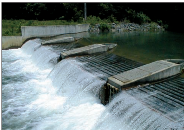
Figure 2. Improvements in Tennessee Valley Authority dam operations include (left) surface water pumps in the Douglas Reservoir (French Broad River, NC), designed to push oxygenated water from the surface to deepwater turbines, and (right) infuser weirs downstream of Chatuge Dam (Hiawassee River, NC), designed to provide both minimum flow and dissolved oxygen.