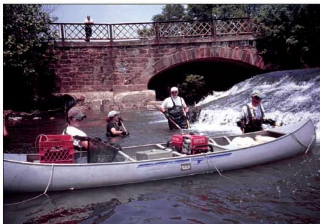
Figure 5. The effectiveness of dam removal as a method of river restoration is being evaluated in several regions of the US. (left) Scientists from Philadelphia's Patrick Center for Environmental Research study the removal of the 2-m high milldam on Manatawny Creek in southeast Pennsylvania in Aug 2002, (right) after documenting ecological conditions before the dam was removed (Bushaw-Newton et al. 2002).