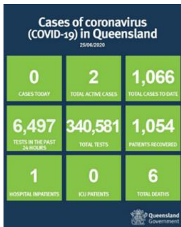
FIGURE 2: DAILY FACEBOOK POST [20]

Platforms such as Twitter have been active sharers of information and COVID related research. [22] Controversy and debate have emerged over mask wearing and new evidence reviews have been promoted on Twitter. [23] #Masks4all.org.uk was established by more than one hundred doctors to promote the wearing of home-made masks to reduce direct transmission and environmental contamination. This group is active on Twitter, Instagram and Facebook and share the emerging evidence on masks.[24]