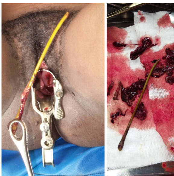
Fig. 1 Cassava stalk and necrotic debris immediately after removal

Uterine perforation and bowel injuries are the major complications following unsafe abortion. The incidence