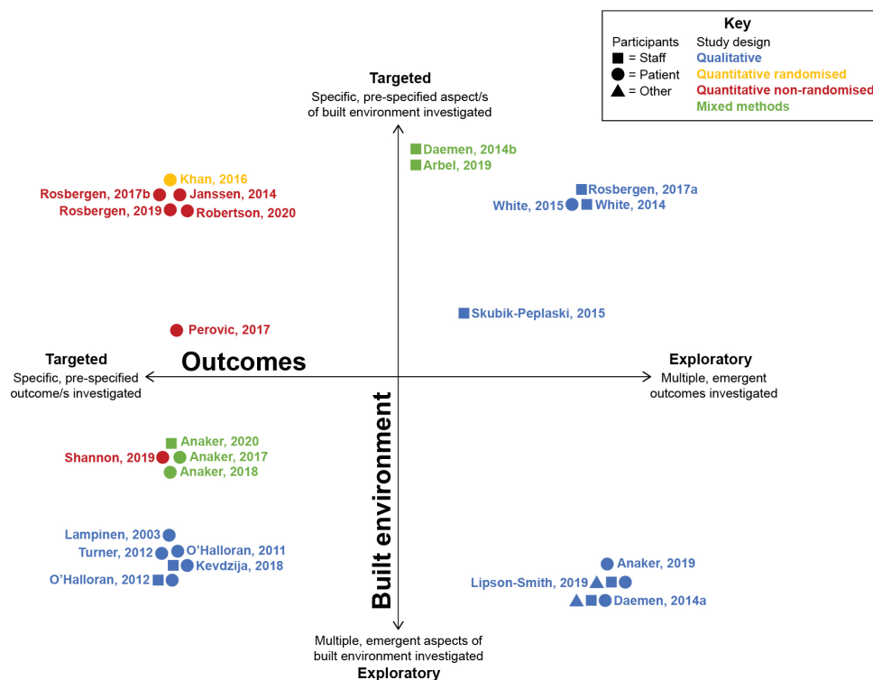
Figure 2 Research method and focus of included articles. Articles are clustered according to the extent to which they prespecified the specific aspects of the built environment or outcomes to be investigated (targeted vs exploratory research).

taken (see top left quadrant of figure 2). The role of the built environment in general was the focus in nine articles, in relation to specific outcomes of interest (lower left quadrant of figure 2), and the research questions in three articles were purely exploratory, with no predefined aspects of the built environment or outcomes of interest (bottom right quadrant of figure 2).