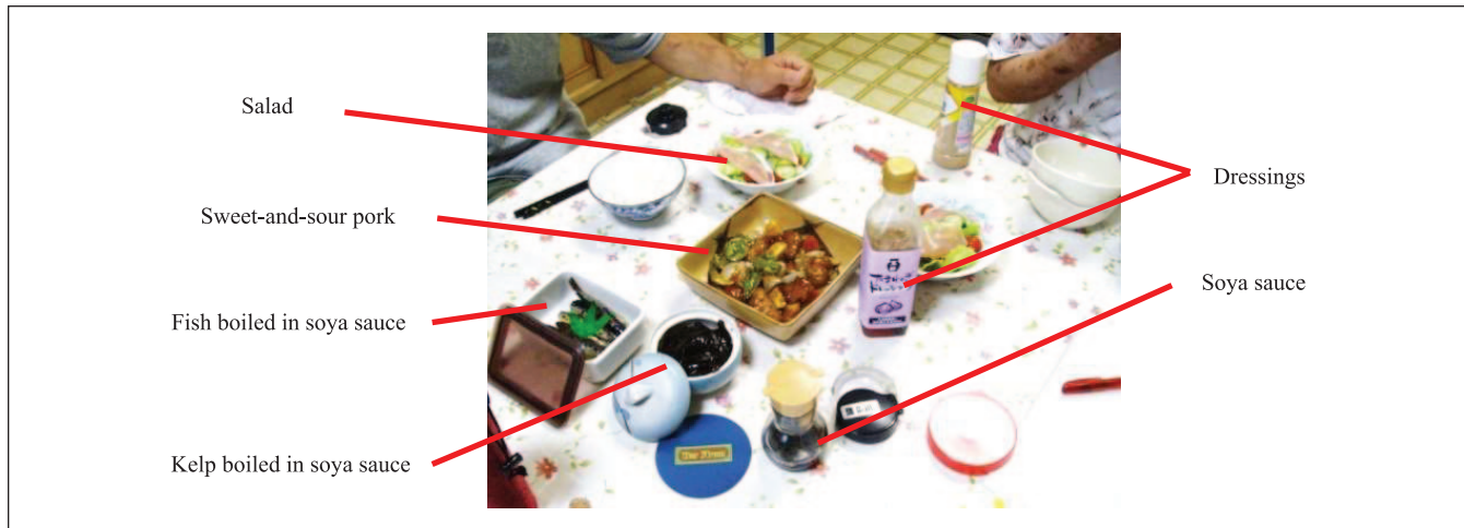
Figure 1. Mr. D's dinner table.