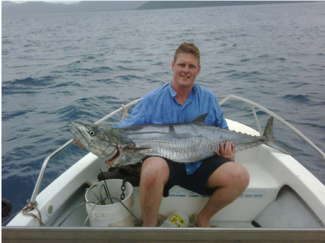
FIGURE 2. A recreational angler holding a Spanish mackerel ( Scomberomorus commerson ). The fish, with an intact weight of approximately 30 kg, was caught off Cairns, North Queensland, in August 2010.

These fish were tested by routine chemical analysis (Stewart et al., 2010) — a method that is neither cost-effective nor sufficiently rapid to be considered as a screening tool. Although both fish were found to be negative for Pacific ciguatoxins and both turned out to be fine table fish, these specimens would have been rejected for sale by the Sydney Fish Market and other Australian seafood distributors. This demonstrates the as-yet unrealised global potential for a suitable screening test or assay. The ability to screen fish reliably, before sale or consumption, for the presence of clinically-relevant concentrations of ciguatoxins would confer benefits for the protection of public health and open up the economic potential of fisheries that are currently subject to ciguatera-risk constraints based on the somewhat blunt instruments of fish size, species and geographical location.